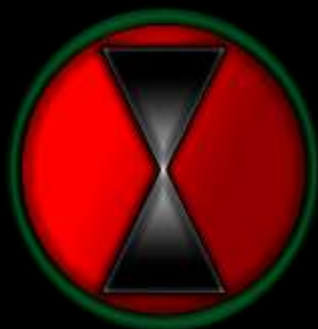
“Globally Responsive and Regionally Engaged”