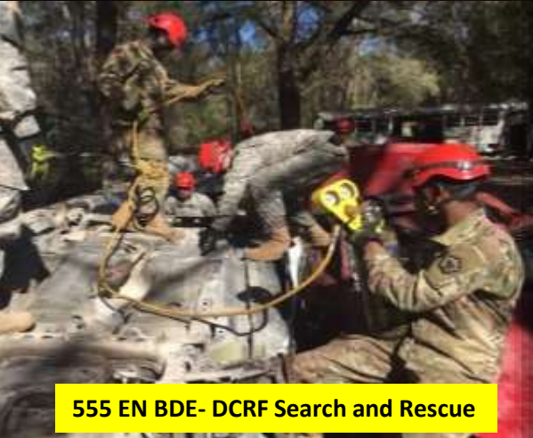
555 EN BDE- DCRF Search and Rescue