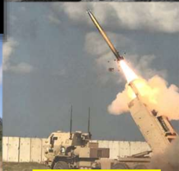
17th Fires Brigade – First Round