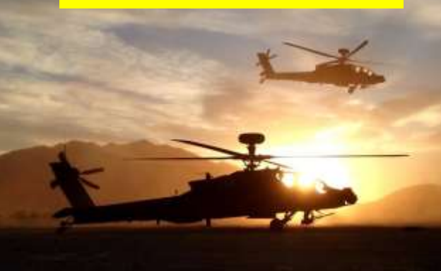
16th CAB – Afghanistan Deployment