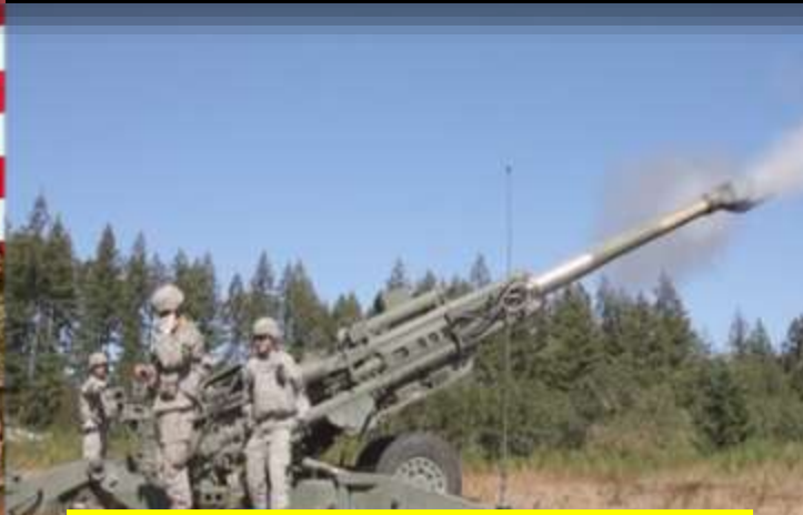
2nd Division Artillery – Home Station Training