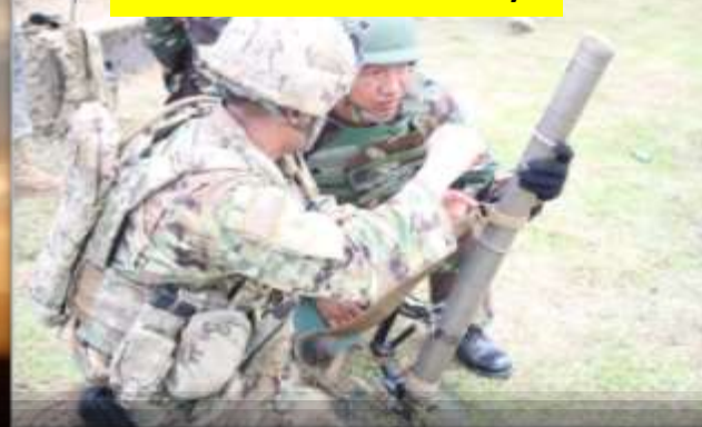
2-2 SBCT – Pacific Pathways