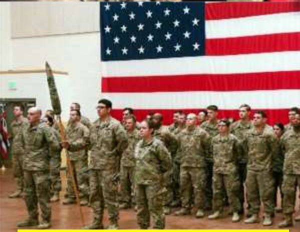
201st EMIB- 502nd MI BN Redeployment