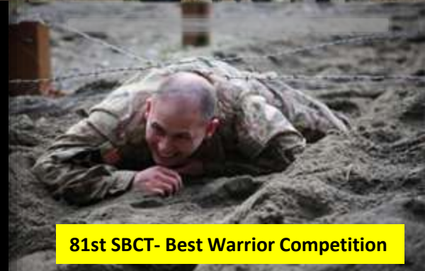
81st SBCT- Best Warrior Competition